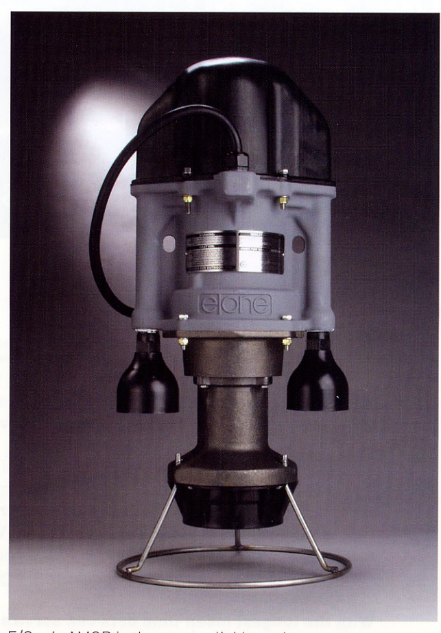
E/One's AMGP is the most reliable replacement pump on the market, with an 8-10 year mean time between service calls – including no preventive maintenance calls.

The AMGP is engineered to fit virtually any other grinder pump well. Its universal design allows ready-to-connect, easy drop-in changeover. So don't put up with one more maintenance disaster from your centrifugal pump. Call E/One and start making your life easier today.