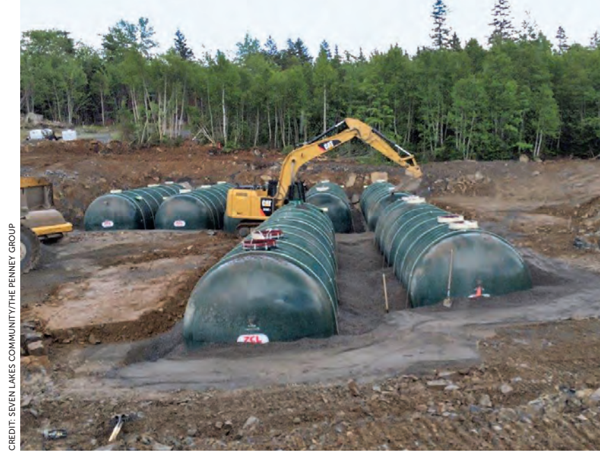
Repeat performance. Massive storage tanks store wastewater until it can be biologically broken down and used to recharge roundwater.

That effort—the Villages of Seven Lakes—broke ground in 2014 next to the small town of Porters Lake (pop. 3,200), an exurb of Halifax, the capital of Nova Scotia in eastern Canada. A long-time dream envisioned by Penney Group President Gail Penney, the residential development detours from the 21st-century approach of big profits derived from over-sized homes on tiny