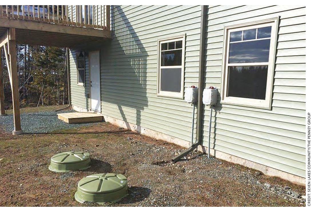
It's a grind. E/One grinder pump station can propel wastewater for more than two miles—even uphill—and help re-invent the terrain.

"Traditional septic systems result in expansive lawns, and large spaces between home sites. Our design addresses these issues. We can design our lots to suit the land and the needs of homebuyers first and foremost," says Penney. "We do not need to plan the homes around the soil conditions required for septic design."