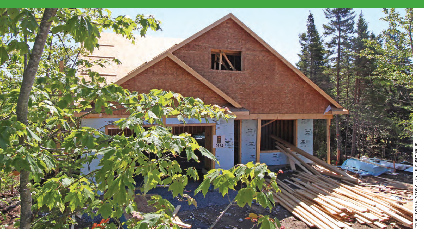
The nature of things. Gravity-driven sewer systems get a thumbs-down from Seven Lakes developers, because they require removal of a large amount of vegetation from homesites.

wetlands, vernal pools and flood plains. Although the popular area provides numerous access points for boating, swimming, fishing and other activities, Penney says they decided not to locate homes around the lake front. Besides guaranteeing everyone full access, the policy protects the lakes from at least some human footprint.